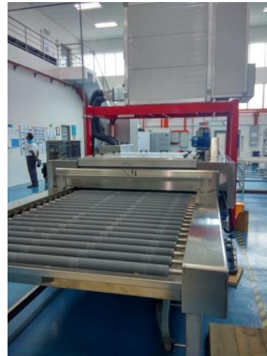
001A. Glass Washing Machine- Triulzi, Model SY130.4.2.4