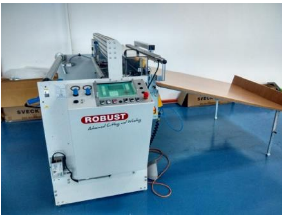
019 Advance Cutting Machine (Robust