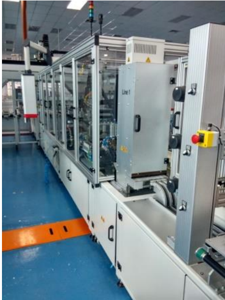
004 Somont Cell Connecting Unit (Line 1)