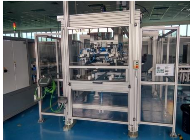
013 Pressing Station Silicon to Frame