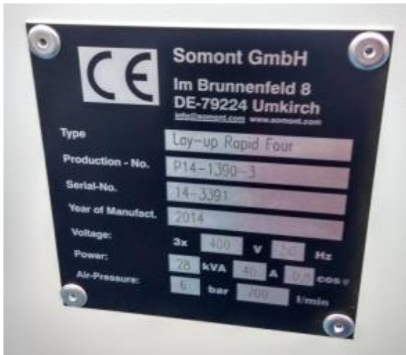
006B Stringer Machine (Lay Up)