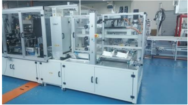
004A Somont Cell Connecting Unit (Line 1)