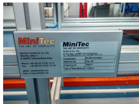
003A Glass Stacker Minitex