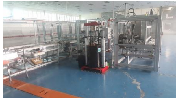
013B Pressing Station Silicon to Frame