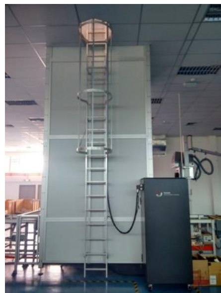
014 Sun Simulator