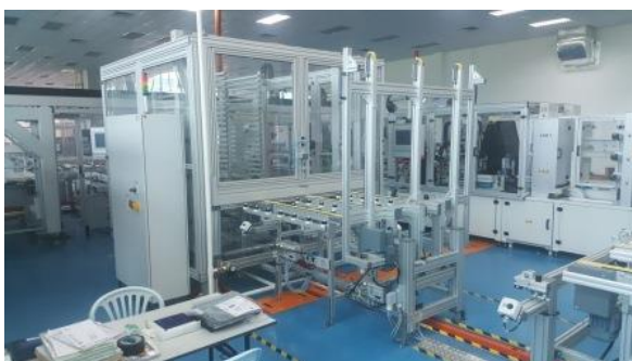
003 Glass Stacker - 20 layers