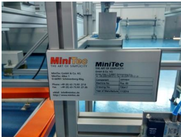
007A Conveying and Transfer Systems - Minitec