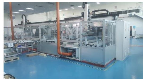
006A Stringer Machine Back View