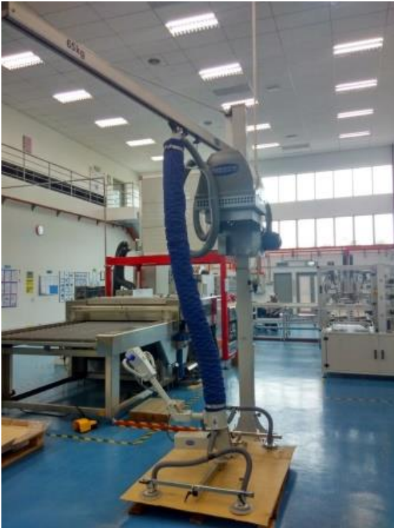
017 Mini crane 65KG - Schmalz