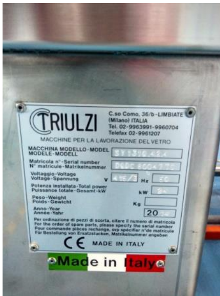
001B Triulzi Glass Washing Machine