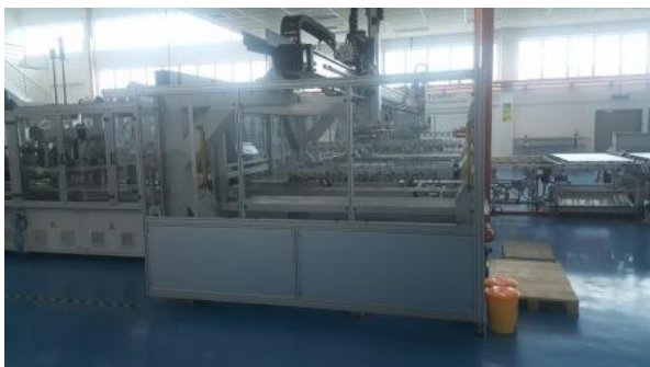
006 Stringer Machine