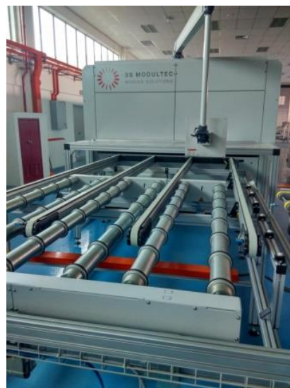
009 Laminating Machine