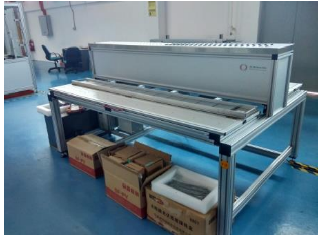
018 Manual soldering machine