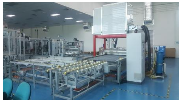
002 Glass Washing Machine with Conveyor