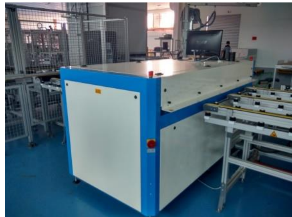
008 Inspection System (Electron) - MBJ