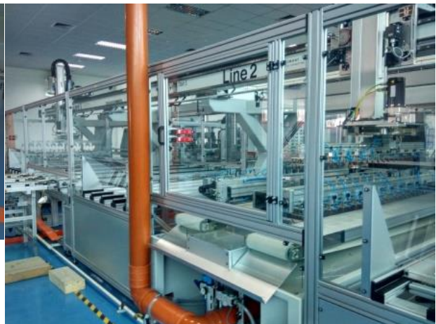
005A Somont Cell Connecting Unit (Line 2)