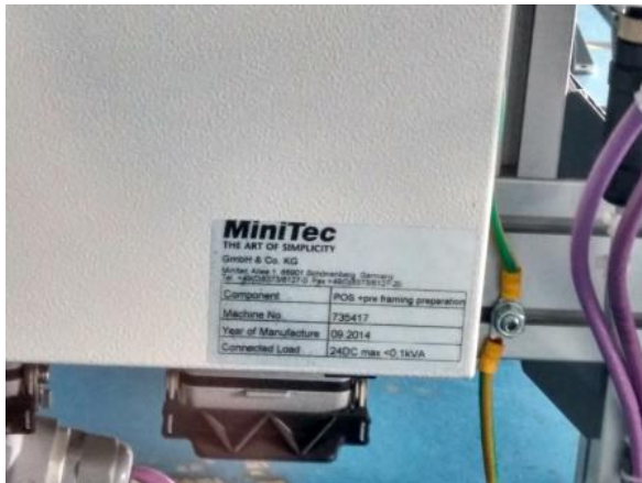
013A Pressing Station Silicon to Frame