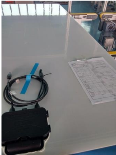
012 Conveying - Junction Box Assembly Section