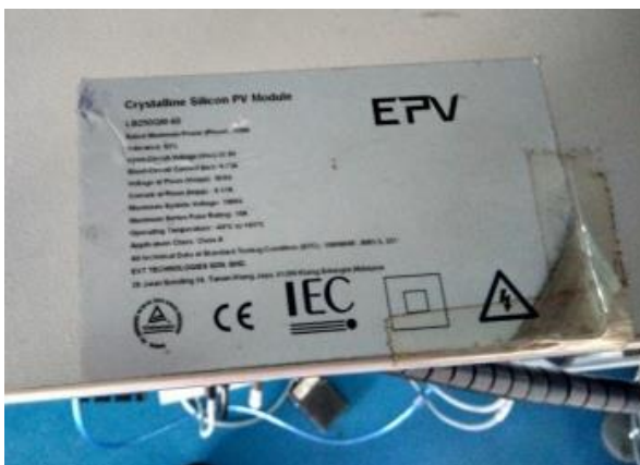
013C Pressing Station Silicon to Frame