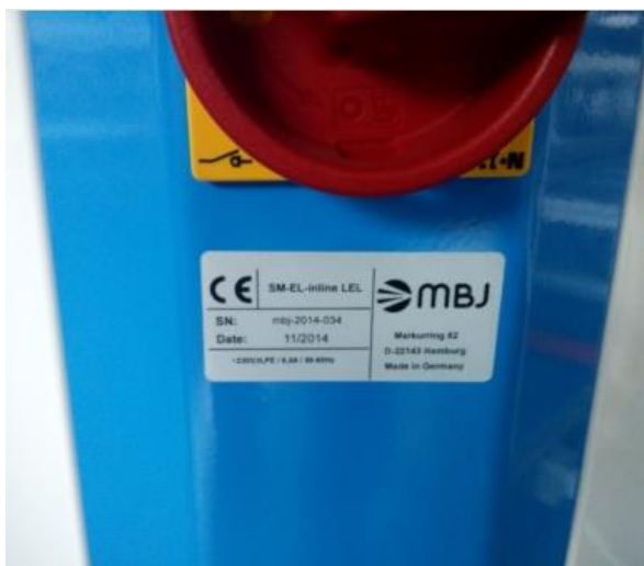
008A Inspection System (Electron) - MBJ