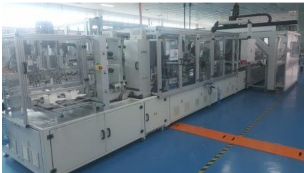
005 Somont Cell Connecting Unit (Line 2)