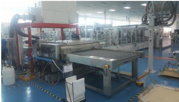
001. Glass Washing Machine- Triulzi, Model SY130.4.2.4

Based on the reference numbers above, photographs of the respective components of the Asset are as follows: